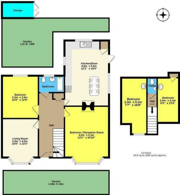
Ground Floor 88.5 sq.m. (953 sq.ft.) approx.

Agents Note: Whilst every care has been taken to prepare these particulars, they are for guidance purposes only. All measurements are approximate and are for general guidance purposes only and whilst every care has been taken to ensure their accuracy, they should not be relied upon and potential buyers/tenants are advised to recheck the measurements